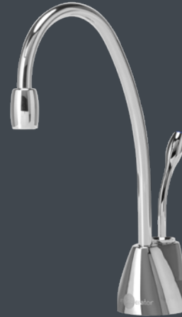
CH1100 - Chrome Product Code: CH1100-CH