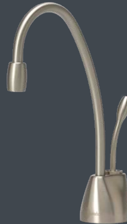
CH1100 - Brushed Product Code: CH1100-BR