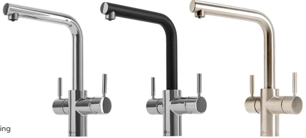
Product Code: MTLIA-CH Finish: CHROME