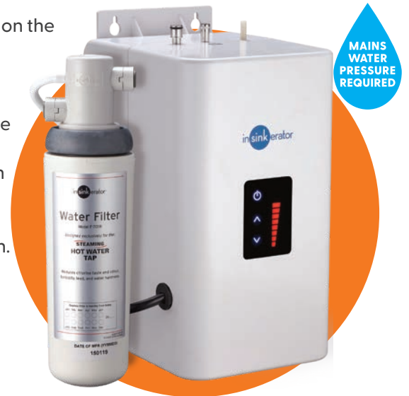
Easy to install under sink tank & water filter