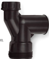
Tail Pipe Black For models EVO100, EVO200, and SEPTIC2000 Product Code: IP75436