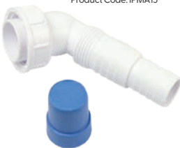
Dishwasher Connector Product Code: IPMA15