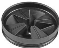
Removable Baffle - Quiet Collar Sink Baffle For models 56, 65, 65+, 66, EVO100, EVO200 and SEPTIC2000 Product Code: IP77960