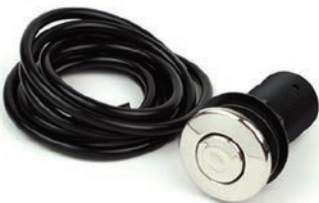
Air Switch Button For use with models with existing air switch Product Code: IP75430B