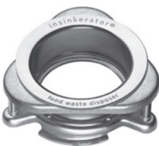
Polished Stainless Steel Mounting Assembly For models 56, 66, EVO100, EVO200 and SEPTIC2000 Product Code: IP3173ED