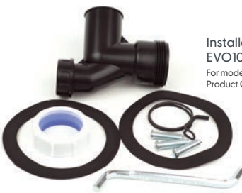
Installation Kit for models EVO100, EVO200 & SEPTIC2000 For models EVO100, EVO200 and SEPTIC2000 Product Code: IP75268

InSinkErator® Spare Parts use an easy to assemble, do-it-yourself style collection for your kitchen to maintain and upkeep your InSinkErator®.