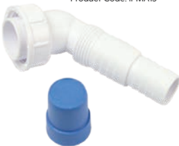
Dishwasher Connector Product Code: IPMA15