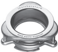
Polished Stainless Steel Mounting Assembly For models 56, 66, EVO100, EVO200 and SEPTIC2000 Product Code: IP3173ED