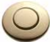
French Gold Finish Product Code: IP73274G