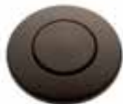
Oil Rub Bronze Finish Product Code: IP73274E