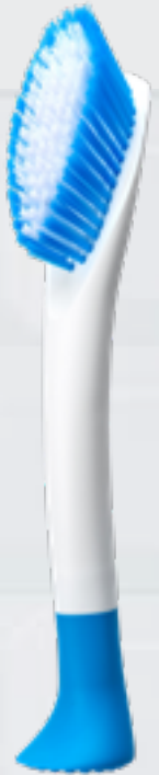
Brush'N'Push - Light Blue Product Code: BNLightBlue