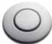
Brushed Steel Finish Product Code: IP73274