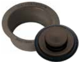
Mocha Bronze Finish Product Code: Flange - IP75069D Product Code: Stopper - IP75073D