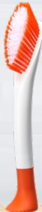
Brush'N'Push - Orange Product Code: BNPOrange