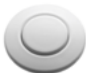
White Finish Product Code: IP73274J