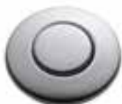
Chrome Finish Product Code: IP73274K

For use with models 56, 66, EVO100, EVO200 or any model with an Air Switch Kit.