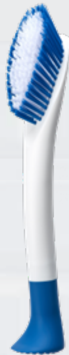
Brush'N'Push - ISE Blue Product Code: BNPISEBlue