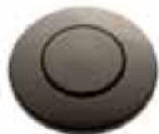
Mocha Bronze Finish Product Code: IP73274D