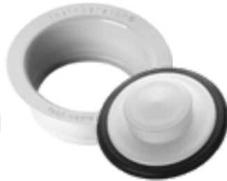
White Finish Product Code: Flange - IP70908D Product Code: Stopper - IP70117D