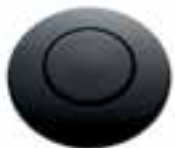
Glossy Black Finish Product Code: IP73274A