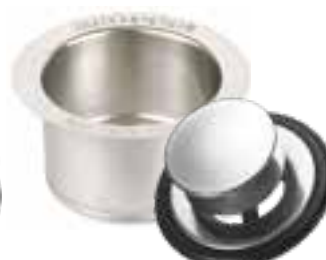
Extended Stainless Sink Flange Product Code: Flange - IP10082 Product Code: Silver Saver Stopper - IP72375D