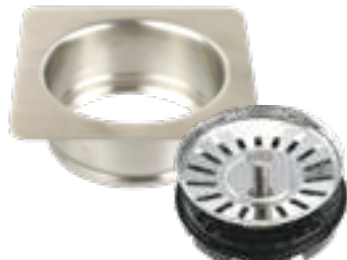
Square Waste Sink Adapter Product Code: Flange - IP80000 Product Code: Evolution Strainer Plug - IP75265