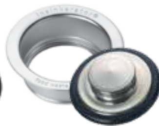
Brushed Stainless Finish Product Code: Flange - IP74290D Product Code: Stopper - IP74278D