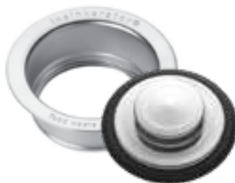
Polished Stainless Finish Product Code: Flange - IP10025P Product Code: Stopper - IP5032A

Your food waste disposer is tucked away out of sight under your sink. But, that doesn't mean that it can't make a visual statement in your kitchen. Select a custom sink flange & stopper from one of the many available finishes to give your sink a designer's touch & make a statement about your style.