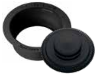
Matte Black Finish Product Code: Flange - IP75090D Product Code: Stopper - IP75094D