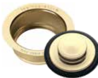
French Gold Finish Product Code: Flange - IP75083D Product Code: Stopper - IP75087D