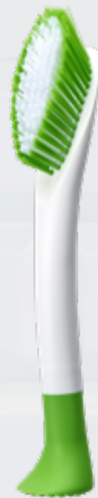
Brush'N'Push - Green Product Code: BNPGreen