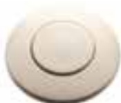
Biscuit Finish Product Code: IP73274B